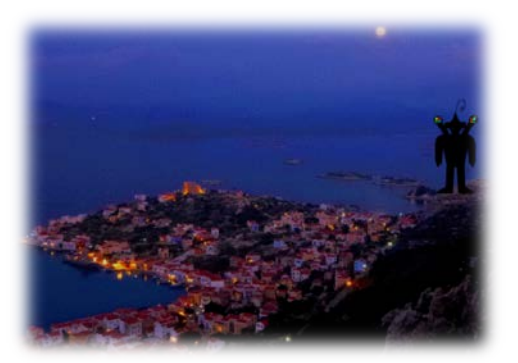
The Puzzle Ninja protects the MAA from above