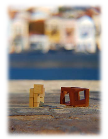
Goal: Construct a cube inside the cage. <a href="http://www.vinco.cz/">http://www.vinco.cz/</a>

Manufactured and designed in 2016 by Vaclav Obsivac. Made of wood.