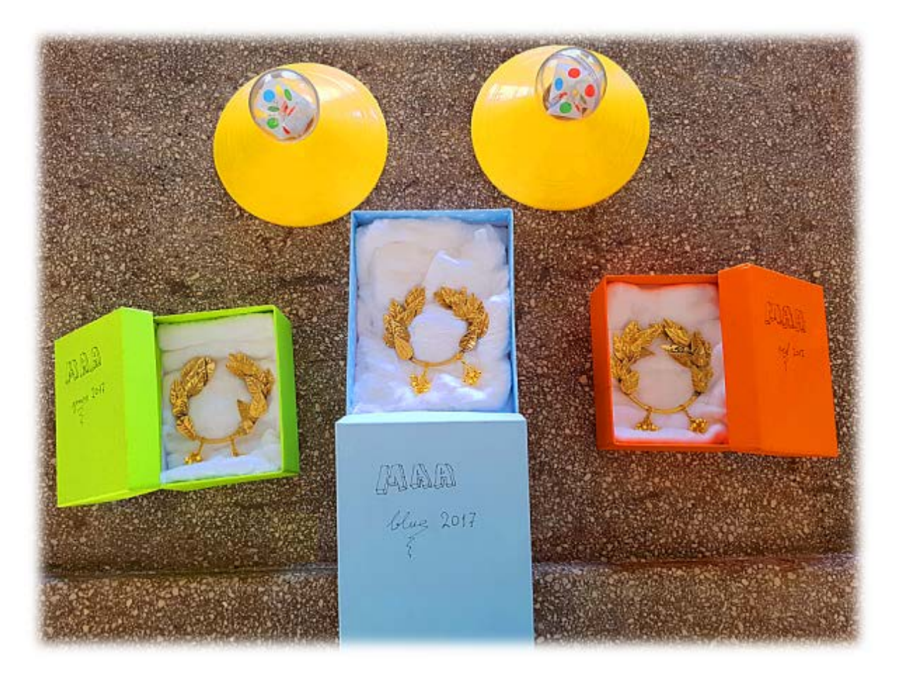
At the top, the puzzles for the red competition. At the bottom, the three prizes (Wreath of Megisti) for the three competitions (green, blue and red).

The Megistian Aenigma Agon is a Triple International Puzzle Competition (Interaction, Inscription/Illusion and Invention). The word Megistian comes from one of the island's names (Megisti), Aenigma means puzzle, and Agon stands for competition. It is a celebration of toys and word-games for children from 0 to 150 years old, presenting to the world Greece's leading role in puzzles. As a definition, a Puzzle, an Aenigma or a Brainteaser, is anything which trains our mind.