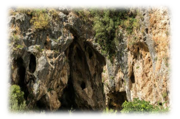
How many ghostly faces are hidden inside the photo?.