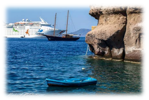
How many boats are there in the photo?.