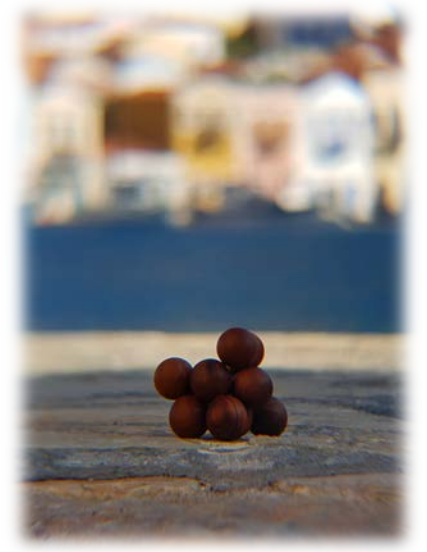
Goal: Make an icosahedral form from four identical pieces. <u>http://www.vinco.cz/</u>