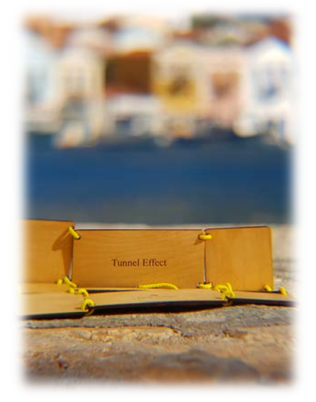
Goal: Bring the rod to the other side. http://puzzle.palyn.ru/

Manufactured and designed in 2013 by Kirill Grebnev. Made of plywood, nylon.